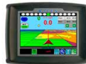
Envizio Pro II

Go through monitor and precision equipment settings to confirm all systems are functioning correctly. While checking for necessary updates.